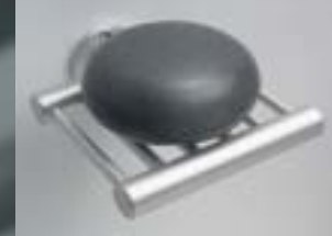
SD Soap dish