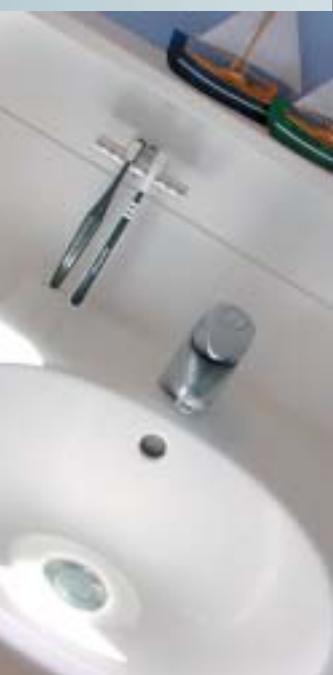
TBH/4 Toothbrush holder