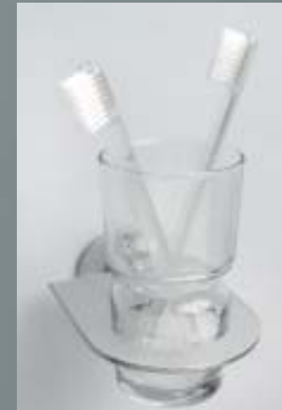
CH Cup holder