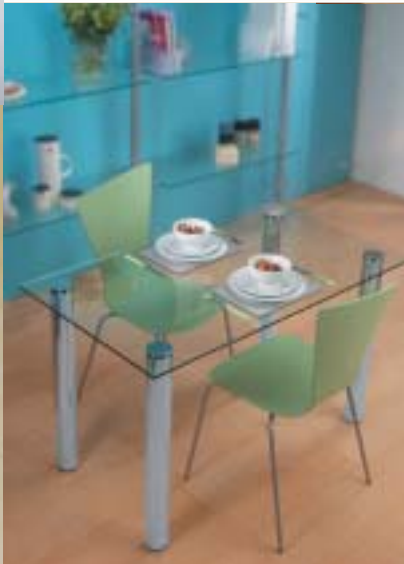
Legs mounted to a rectangular glass top table