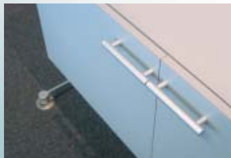
Anodised aluminium handles. available in 12, 16, 19, and 25mm diameter versions