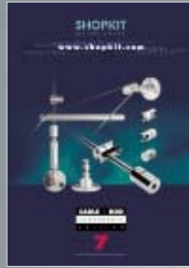
Cable & Rod Components