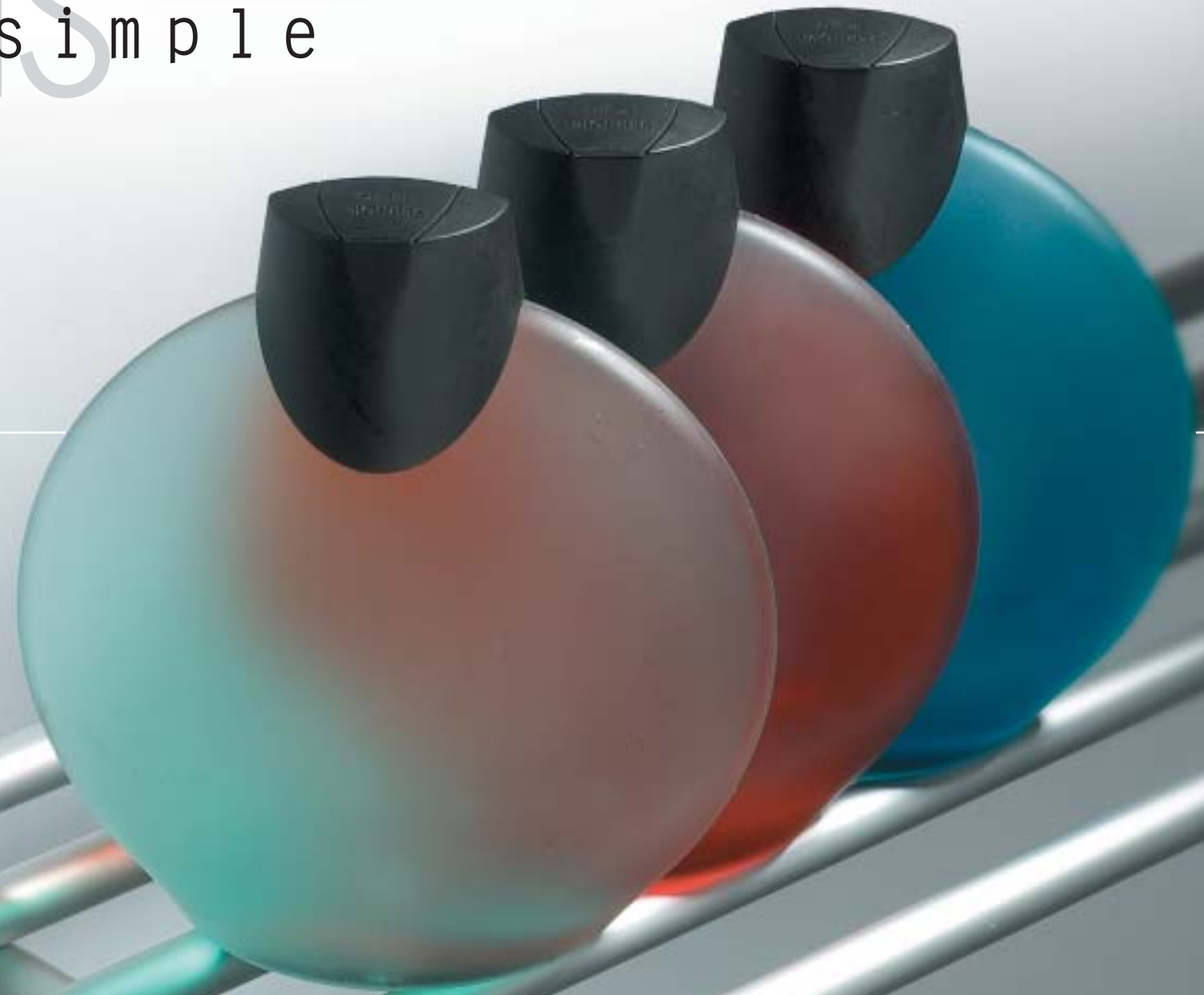
RS/5B Rod shelf - 5 bar