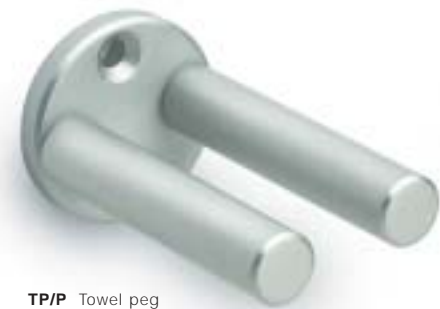
TP/P Towel peg prong style