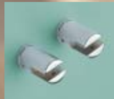
GSC/CB Chromed brass shelf clamp

A range of easy to assemble shelves for individual wall mounted locations, using support brackets shown below or for integrating with wall shelving systems as shown on previous pages.