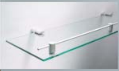
GSR Glass shelf rail