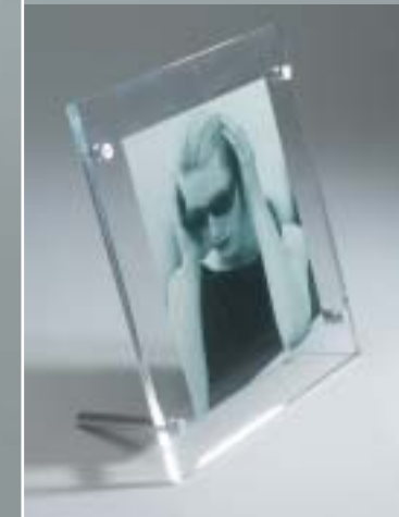
PF Desk top picture frame. A free standing picture frame made from two 5mm sheets of acrylic with satin anodised aluminium or polished stainless steel fittings. All sizes – made to order. Please contact our Technical Department