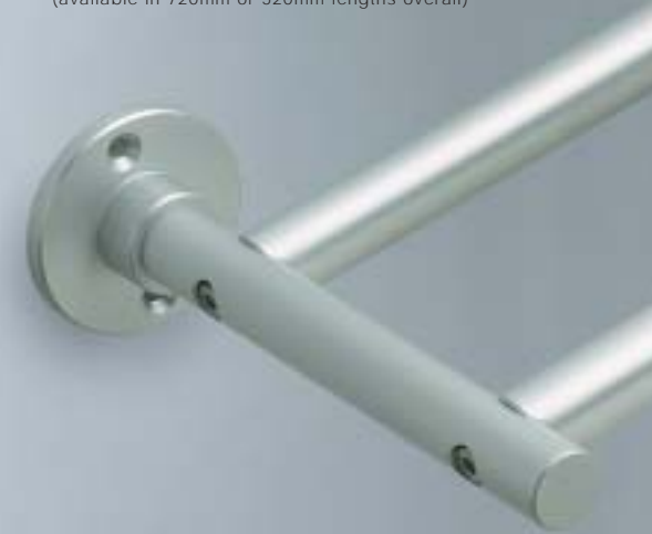
TR/T Twin towel rail (available in 720mm or 520mm lengths overall)