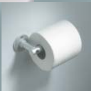
TRH/AA Toilet roll holder - angled arm