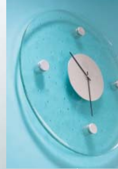
C/G Glass wall clock approximately 400mm diameter. Hand made glass surround. Battery operated