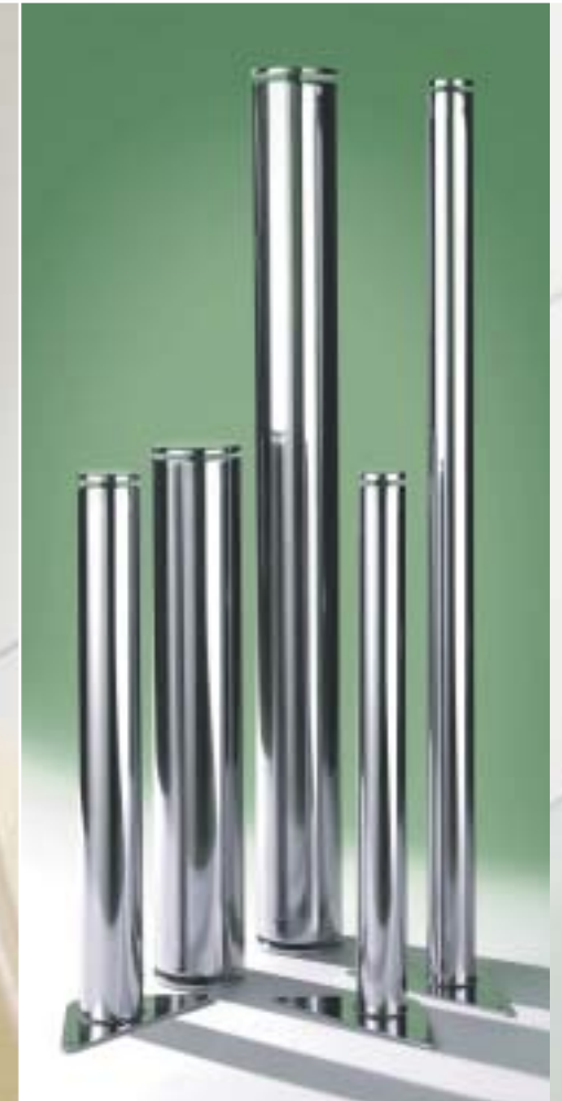
Table legs for either glass or solid timber/laminate tops