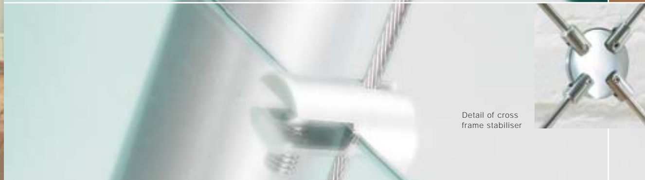
Detail of cross frame stabiliser