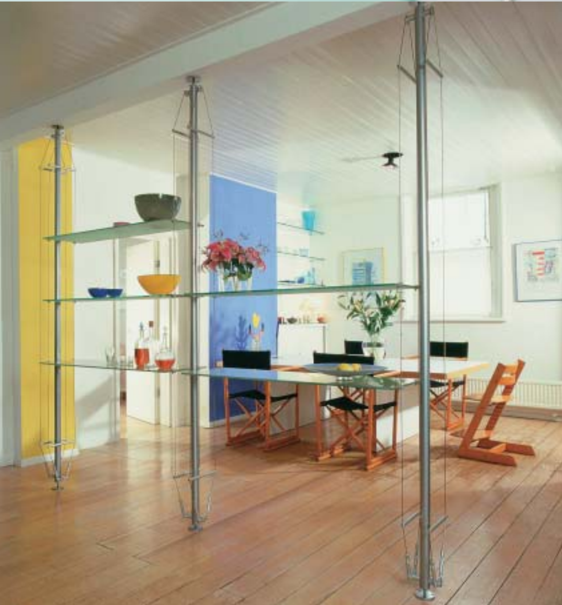
Twin rig Mast System Shown in a floor to ceiling installation.

Please refer to our Mast brochure for additional installation options and product information.