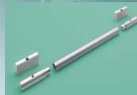
BH/SA Block handle components