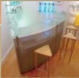
Custom made bars and reception desks