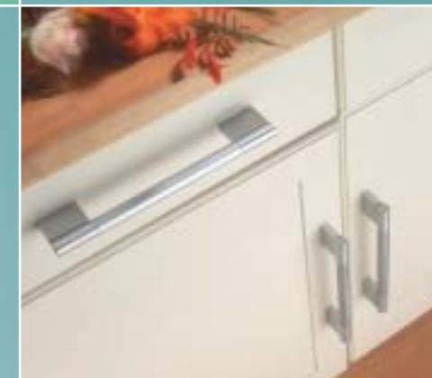
Block handles in situ