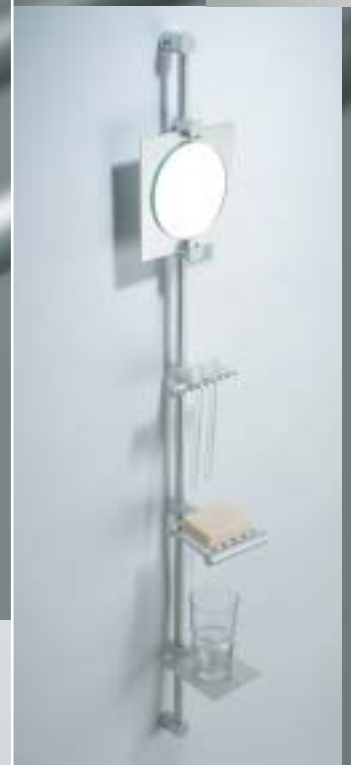
BRS Bathroom on a stick