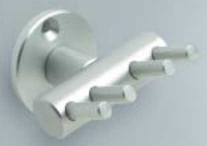
TBH/2 2 Toothbrush holder