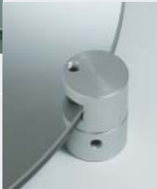
SF/3/29 Wall fixed panel/mirror support in satin anodised aluminium finish – 30mm diameter. Will hold picture/panels/mirrors up to 10mm in thickness. No drilling of panel required