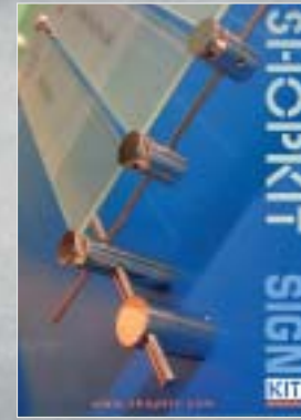
SignKit Signage Systems