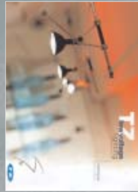
TZ Low Voltage Lighting System