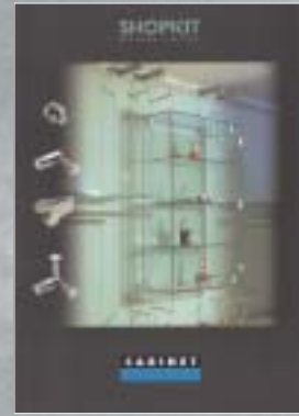
Glass Cabinet Components