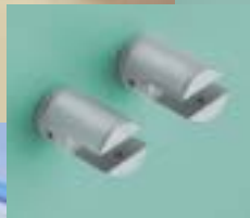
GSC/SA Satin anodised aluminium shelf clamp