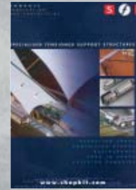
Tensioned Support Structures