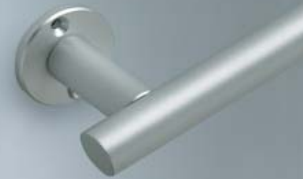
TR/S Single towel rail. (available in 720mm or 520mm lengths overall)