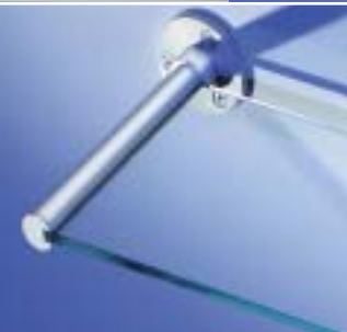
GSB/S Glass shelf support bracket - slot style