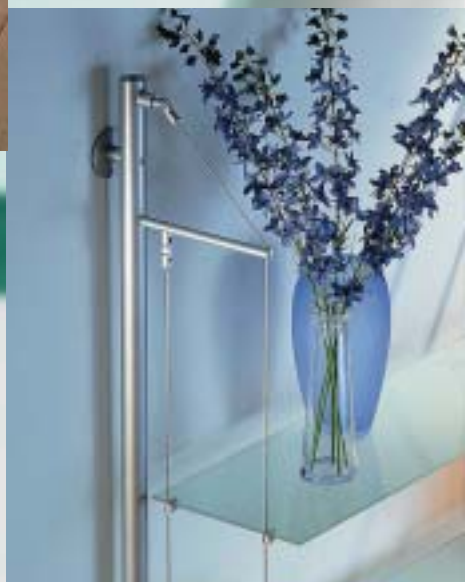
Top section of Single Rig Mast, wall fixed.