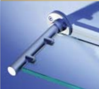
GSB/G Glass shelf support bracket - grip style