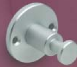
GPH General purpose hook