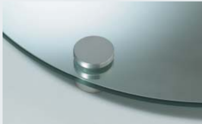
SF/3/26 Wall fixed panel/mirror support in satin anodised aluminium finish – 30mm diameter

A range of mirror fixings in three sizes and two styles. Either edge fixed (see main picture) suitable for holding material up to 10mm in thickness or fixed through the panel/glass. This method requires the panel to be drilled. These fixings can also clamp 2 sheets of glass to mount pictures.