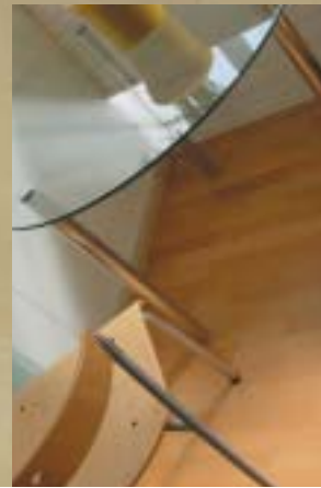
Legs mounted to a circular glass top table

Simply Furniture will make tables and reception desks to your specifications. Please contact our Technical Department for help and advise.