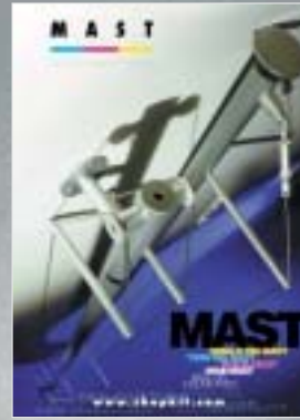
Mast 1, 2, 3 and Track Systems