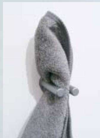
TP/P Towel peg prong

A comprehensive range of hooks, pegs and coatstands with an integrated design approach for ease of use in the home or business environments such as hotels, health clubs or any environment where a strong visual identity is required.