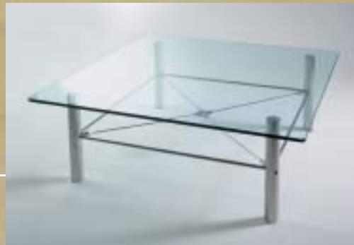
CT Glass coffee table - 900mm x 900mm stainless steel frame with stainless steel cross frame stabilizer and 1200mm x 1200mm safety glass top.

All legs come in a variety of lengths and diameters. (Please refer to Simply Furniture Price List for details).