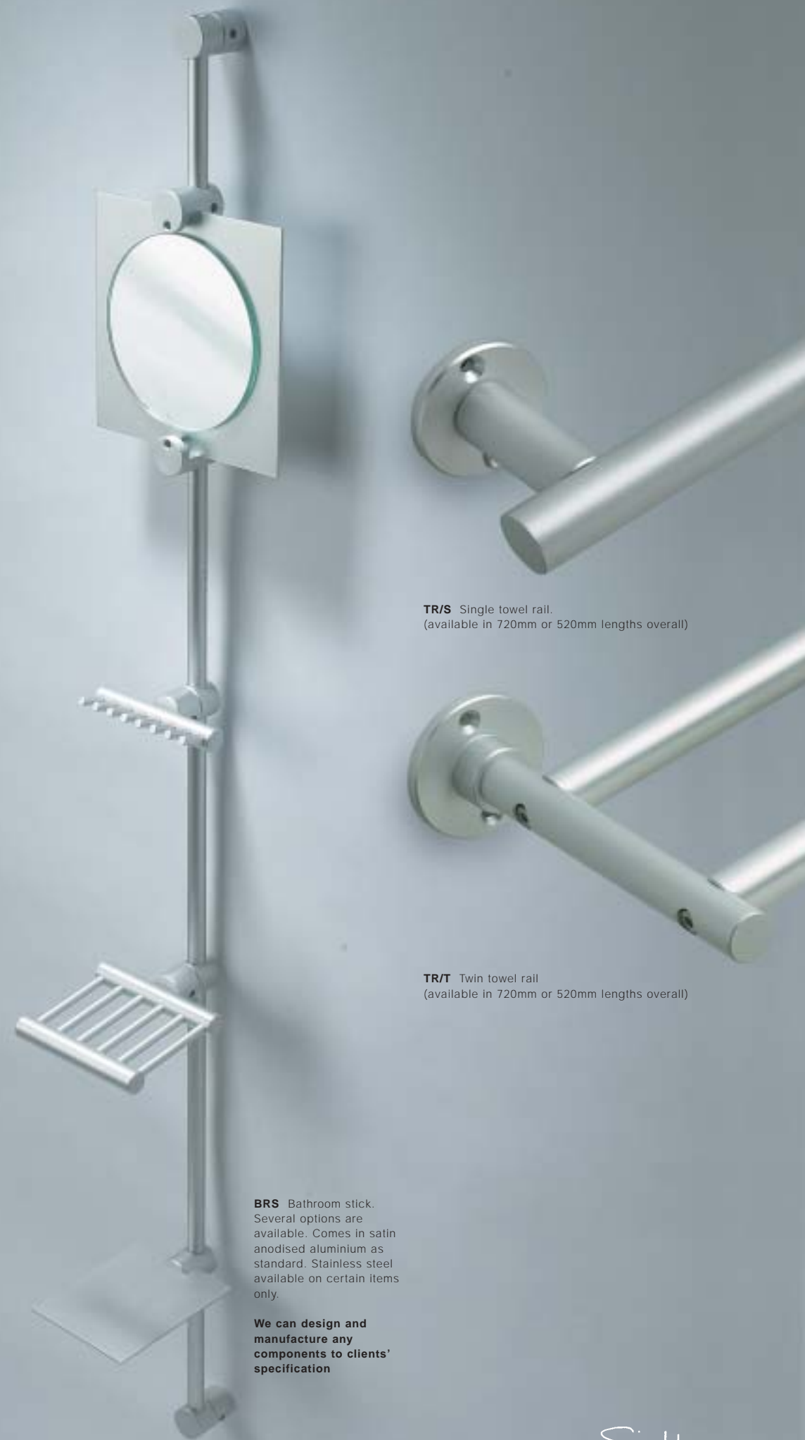
BRS Bathroom stick. Several options are available. Comes in satin anodised aluminium as standard. Stainless steel available on certain items only.

We can design and manufacture any components to clients' specification