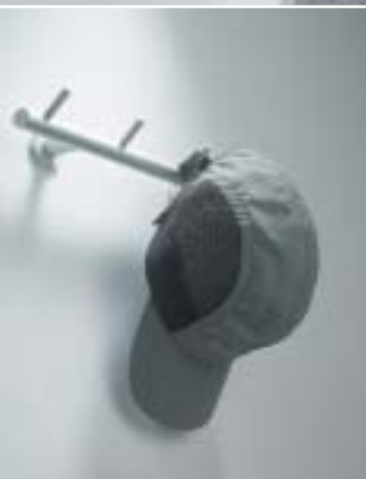
CH/4P Coat hook4 peg