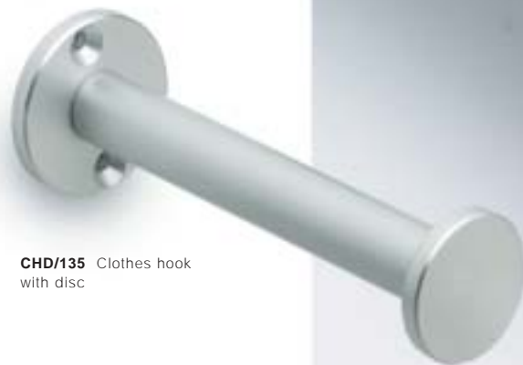
CHD/135 Clothes hook with disc