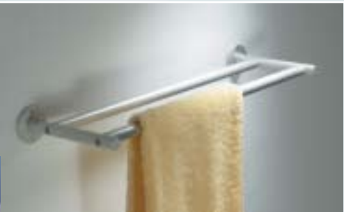
TR/T720 Twin towel rail (720mm overall)

A range of bathroom accessories including toilet roll holders, toothbrush holders, soap dishes, towel rails etc. simple to fit. All finished in satin anodised aluminium. Various options can be created by our Technical department.