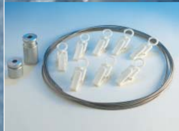
CCK Curtain on cable kit