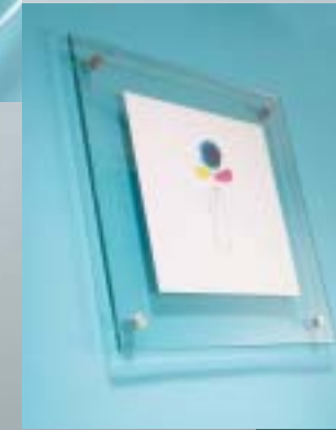
SF/15/27 Wall fixed panel support, disc diameter 19mm, will hold picture or panels up to 10mm in thickness. Requires 13mm hole drilling in panels