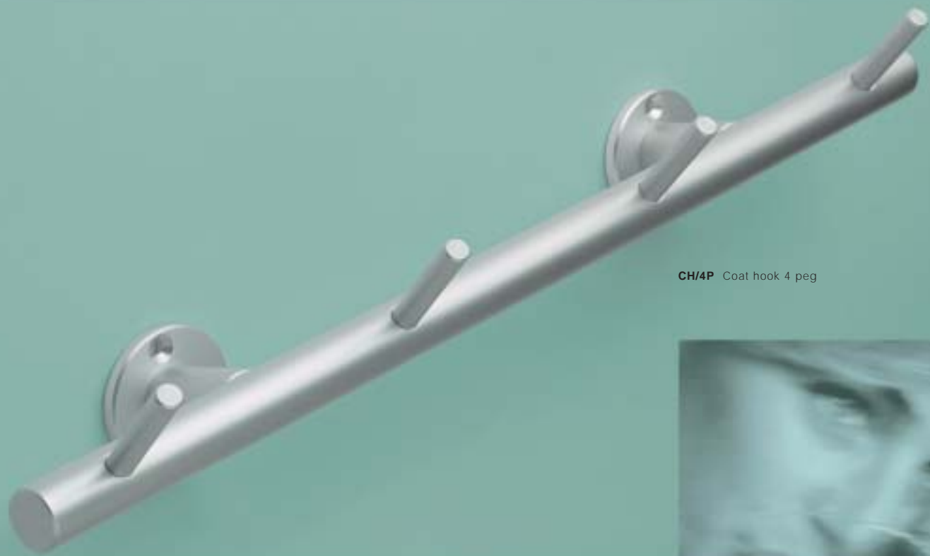
CH/4P Coat hook 4 peg