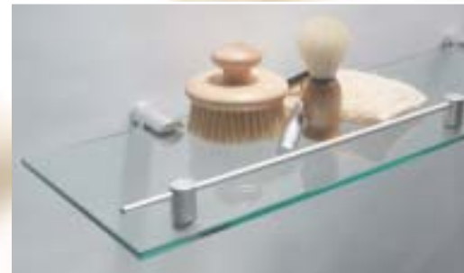
GSR Glass shelf rail. Available in satin anodised aluminium or stainless steel