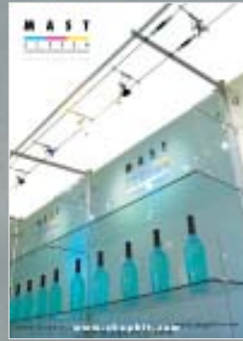
Mast Screen System