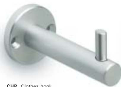
CHP Clothes hook with pin