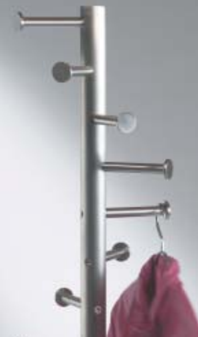
Feature picture: CS/SSP Coat stand in an 90° axis configuration in a polished stainless steel finish